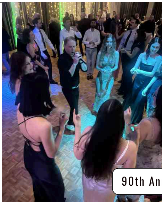
90th Anniversary Ball