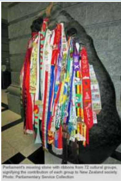
Parliament's mooring stone with ribbons from 72 cultural groups, signifying the contribution of each group to New Zealand society.